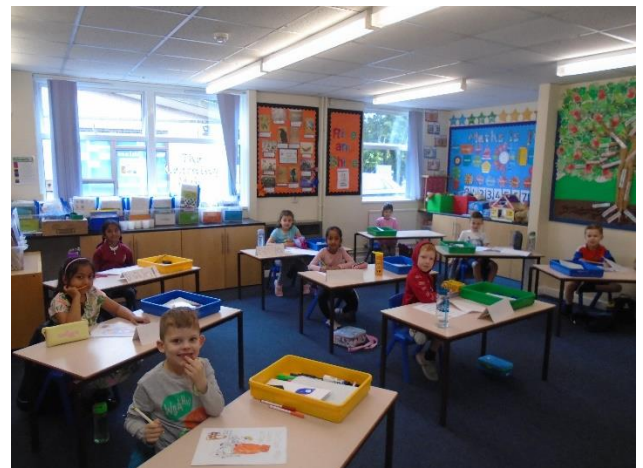
Purple learning about a greedy tiger!