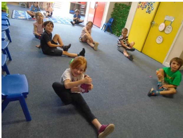
Orange doing Yoga! Good stretching!