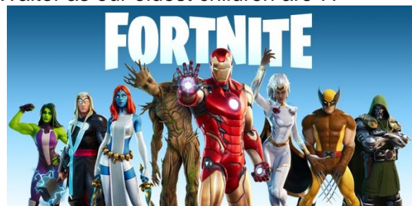
"What is Fortnite and does the video game have an age rating certificate?

games around Fortnite! If you look at the image below you can quickly see that it is not suitable for children at Walter as our oldest children are 7!