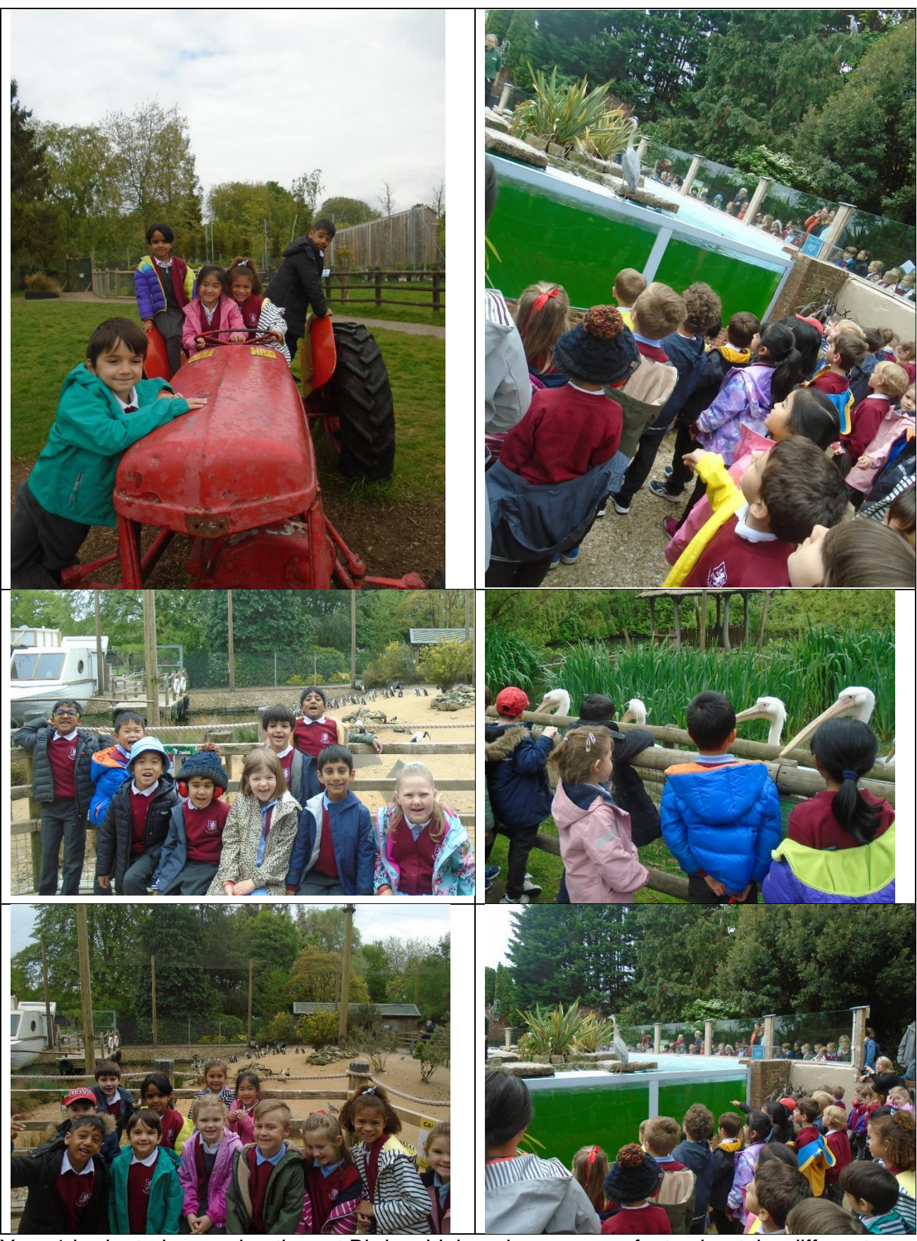
Year 1 had a truly amazing time at Birdworld; learning so many facts about the different birds and many other animals too. I am sure I saw a dinosaur in one of the pictures! All our teachers and support staff were so proud of the children's exemplary behaviours and keen enthusiasm. Every child in Year 1 is a star of the week!