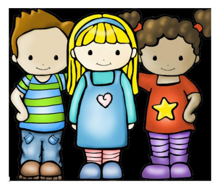
We look different on the outside BUT we look the same on the inside!