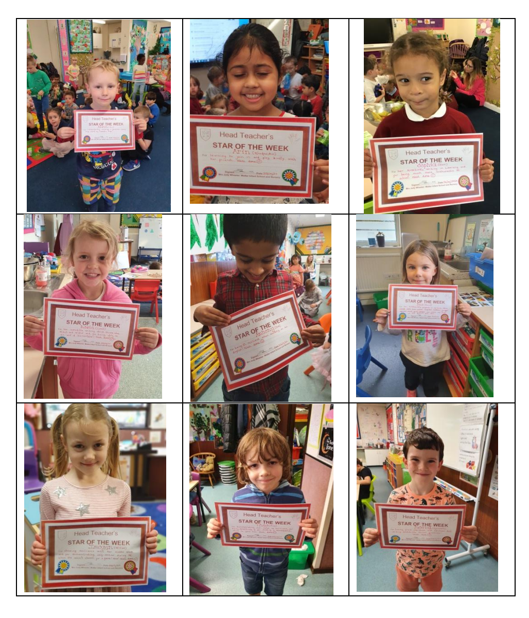
What's been happening in school this week?