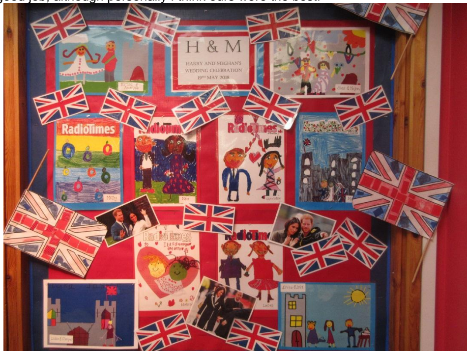
The winning cover: