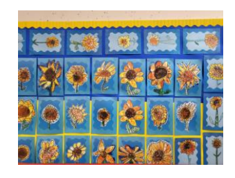
The School Council are VERY excited!