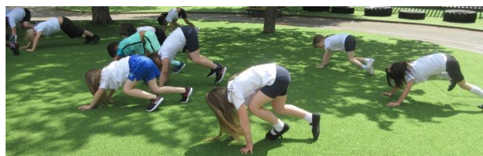
Beech Class Working very hard on their circuits!