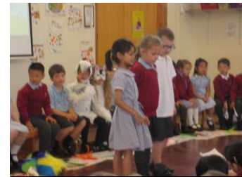
3 of our 30 young scientists