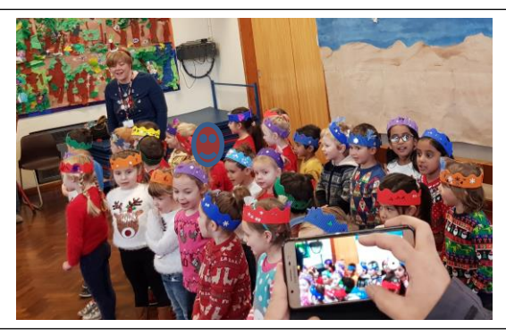
Away in a manger...